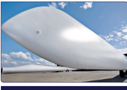
Excellent resistance to fatigue

BluCure<sup>™</sup> Technology), and 40 % bio-based. The system also uses 3B's novel SE3030 glass rovings. Enhanced adhesion to the reinforcement is achieved through an optimized sizing applied on the glass filaments. This sizing gives excellent fibre/resin interaction, resulting in improved composite properties that ensure long-lasting blade operation. In addition, it has been demonstrated that this system can be used for making long blades at a record speed (through faster resin infusion and limited post-cure), giving an increased output per mould and an outlook for excellent process consistency.